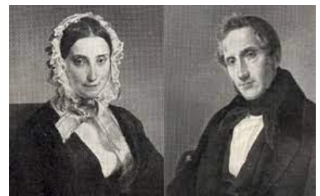
ENRICHETTA BLONDEL - ALESSANDRO MANZONI